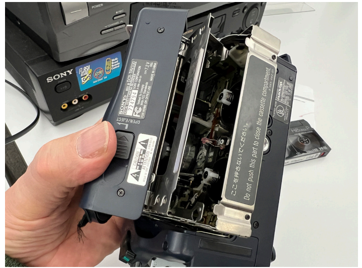
Step 10: As you flip back the outer case the mechanism will automatically open. It moves slowly.