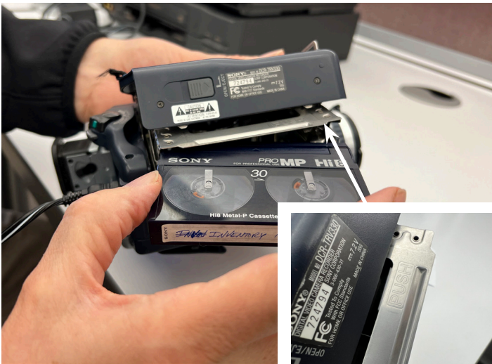
Step 11: Insert the video cassette and carefully push where indicated. The mechanism will automatically begin to close. Once closed, snap the black cover back in place.