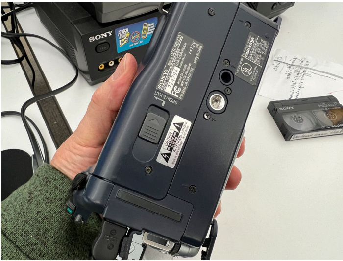
Step 9: Turning the camera over, locate the sliding button to open the tape compartment door.