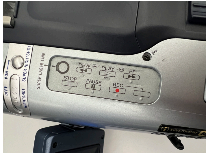
Step 12: Use the controls on the top of the camera to control the tape.