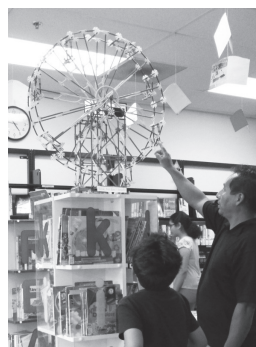
South Branch Summer Reading: A Wheel Good Time

Patrons guessed the number of K'Nex in the working Ferris Wheel at the South Branch, and joined us for Builderfest, crafts, and performances. We even had kids reading between soccer games during Kicking it With the Cops.