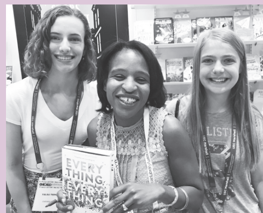
MPPL Teens meet New York Times bestselling author Nicola Yoon at the Chicago ALA conference.