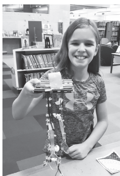
This young patron designed and built windchimes as part of our summerreadingprogram.

A LEGO mini Chicago was just one of the cool things designed for Summer Reading in Youth Services. We welcomed readers who guessed the number of LEGOs in the skyline scene, found the robot roaming around the department each day, and helped their school try for Monty's trophy.