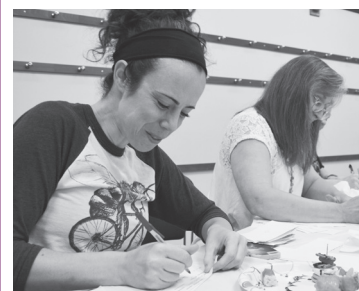
3. Capannari Ice Cream helped judge the creations for the teen Candy Sushi Iron Chef program.