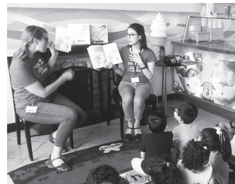
South Branch staff lead a storytime at La Michoacana ice cream shop.

2. Shoppers at Walmart in Mount Prospect received friendly greetings from none other than Library staff, who registered many of them for the Summer Reading Program on Wellness Day at the store.