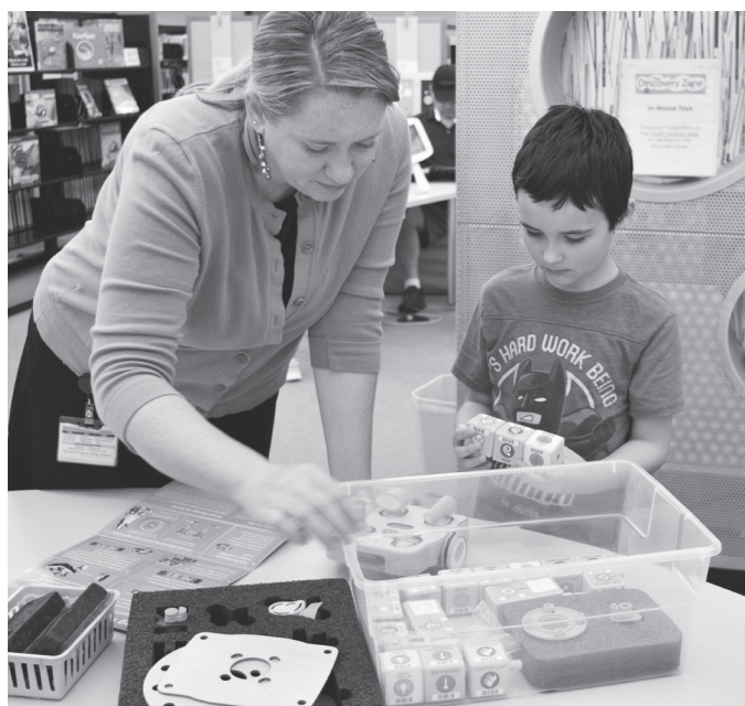
Grants from Bosch help provide STEAM experiences for kids

Scheduling and transportation often make it difficult for students from local schools to come to the Library, so we go to them! Building on the success of the zSpace, the Library brings STEAM stations to schools. Kids can explore using littleBits, or kits that allow kids to be hands-on