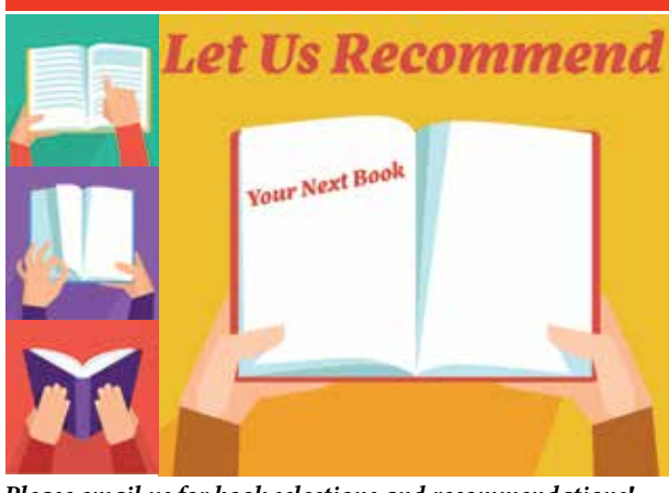
Please email us for book selections and recommendations!

Readers@mppl.org (Adult and Teens) KidsRead@mppl.org (Youth)